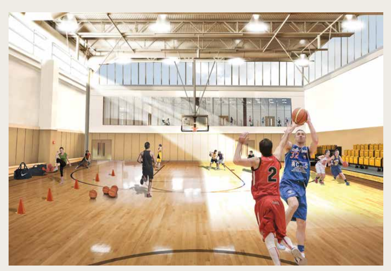
Computer-generated image of proposed sports hall.